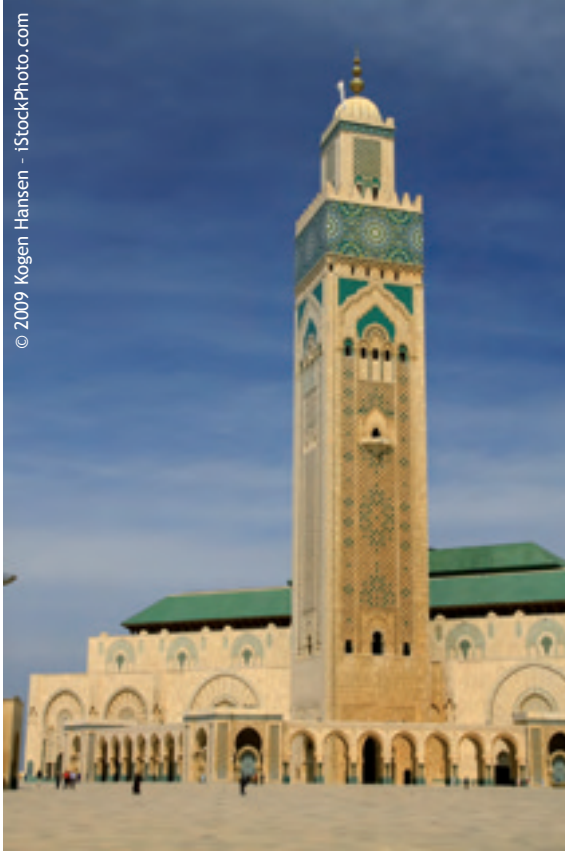
Hassan II Mosque in Casablanca. Africa's largest mosque with its minaret, architecturally symbolising the glory of the kingdom. It respects current norms so as to consolidate a national tradition.