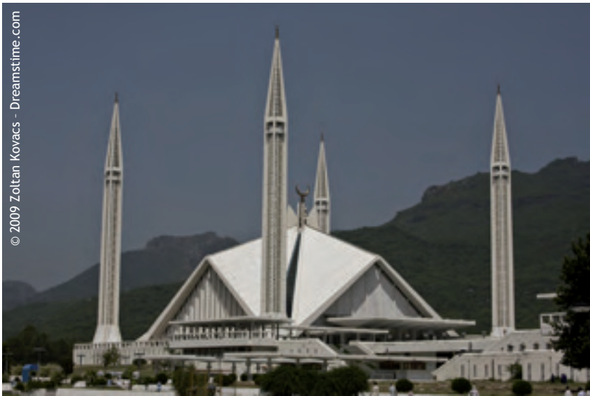
Faisal Mosque in Islamabad. Pakistan’s largest mosque, financed by Saudi Arabia, was begun in 1976 and completed in 1986. Traditionalists have criticised the excessively modern design and the absence of a traditional dome, here replaced by a triangular shape recalling Bedouin tents.

The globalisation characterising the early 21st century has accelerated this cross-fertilisation of architectural traditions. On the architectural level, Islam is anything but a monolith closed in on itself and is sensitive in regard to cultural exchange.