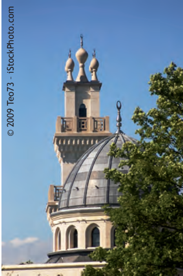
The Oxford minaret.

Paris Mosque: under the tutelage of the Algerian state, a traditional style that emulates principles in effect in the former French colony.