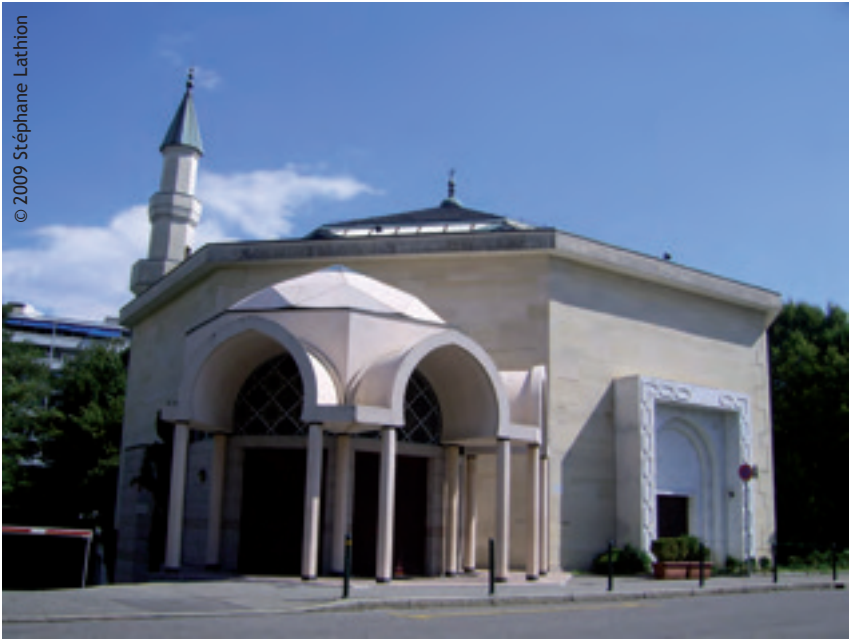
Front view of the building of the Geneva Mosque with its Islamic architectural elements (minaret, colonnades, etc.).

At Roubaix, in the north of France, the initiators of the mosque-building project insisted on its “local” character. The project aimed both to transcend their cultures of origin and to arrive at a symbiosis between the building and the region’s architectural identity: “Our project transcends the different backgrounds and different perceptions of what a mosque should be by integrating the building into the city’s architectural history. This mosque is above all the mosque of Roubaix’s citizens, a mosque that the faithful may be proud of and that all inhabitants may consider a part of the town’s cultural heritage” (comments by the architect Oussama Bezzazi, La Voix du Nord , 28 September 2008).