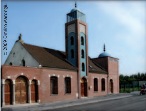
Mosque in the town of Escaudain (Northern France), built on former industrial wasteland.

relationship to the architectural tradition of one's country of origin. Either Islam is kept locked into a culture, or it shakes off its culture of origin so as to free itself from the weight of that local tradition.