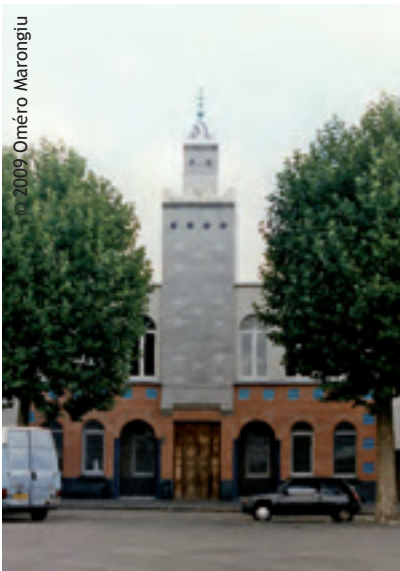
Mosque in the town centre of Denain (Northern France).