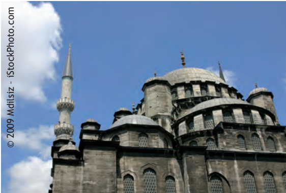
The basilica of Hagia Sophia, built for Emperor Justinian I in 532. After the conquest of Constantinople, four minarets were added to the building to give it the appearance of a mosque.

tion techniques and materials used were those locally available. The gradual transformation of the city of Toledo demonstrates such successive influences over the centuries. Equally, the Church of the Holy Sepulchre built in Jerusalem under Constantine had a cupola identical to that of the Dome of the Rock, whose layout corresponded perfectly to the forms of Christian art then current in Syria and Palestine. Muslims knew how to appropriate a place and Islamise it to the point of turning it into one of the symbols of Islamic art. This occurred again with the Mosque-Cathedral of Cordoba, and even the Basilica-Mosque of Saint Sophia in Istanbul. The re-use of old Christian places of worship – sometimes imposed by force – shows Islam's ability to mould itself on earlier sacred traditions, albeit through conquest.