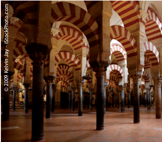
Interior of Cordoba Mosque with its famous pillars and arches.

This cultural exchange is true of architecture as much as anything. Two architectural elements inherited from the Persian Empire illustrate the phenomenon: the iwân , a wide vaulted space that opens onto the outside of a courtyard, and chehar tâq , a structural unit that consists of a cupola resting on four arches and may be used on its own or combined with others, especially the iwân .