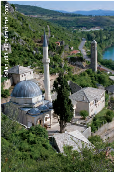
Pocitelj Mosque, 15th century, Bosnia.

Inculturation requires reconciling the imperatives of worship ( minbar , qibla , inner courtyard, basin for ablutions, minaret, etc) with the incorporation of architectural novelties, in terms of both the materials used and the shapes, which have to be adapted to planning regulations in force in various European contexts.