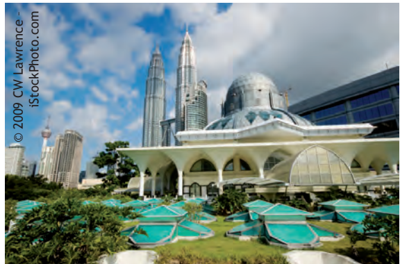
Malaysia: As Syakirin Mosque with the Petronas Twin Towers in the background.