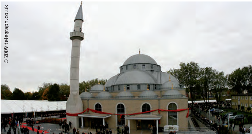
Exterior view of the Duisburg Mosque.

As Muslims settle definitively in Europe, the second option is asserting itself. It underpins a new generation of much more original and innovative projects, in which architects strive to express the new reality of the European Muslim. They want their places of worship to reflect these plural identities and deliberately seek out hybridisation. In other words, over time, traditionalism may well become the minority position in Islamic architecture in Europe.